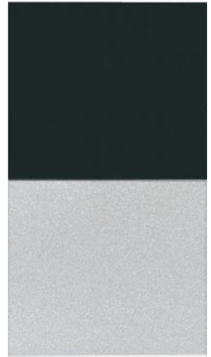
Standard Black Pewter