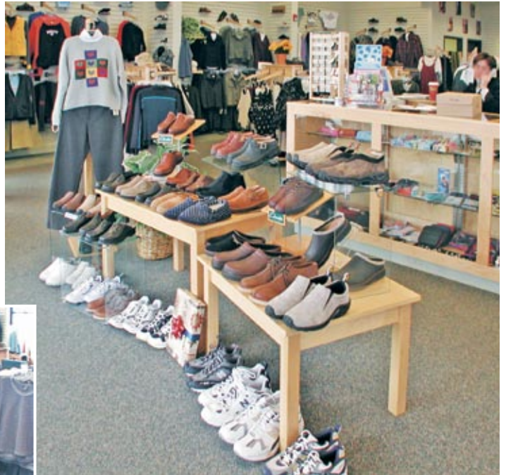
Nesting Tables (pages 141-142).