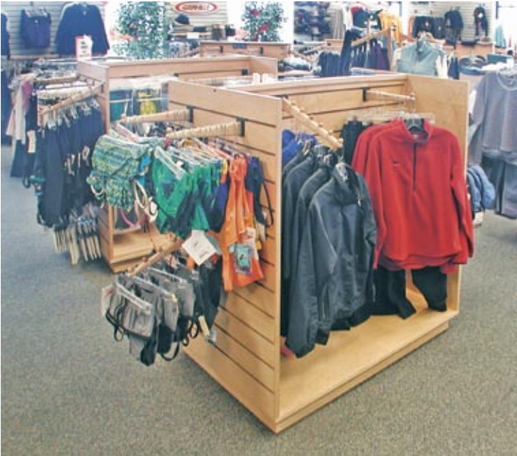
Slatwall H (pages 151-153).