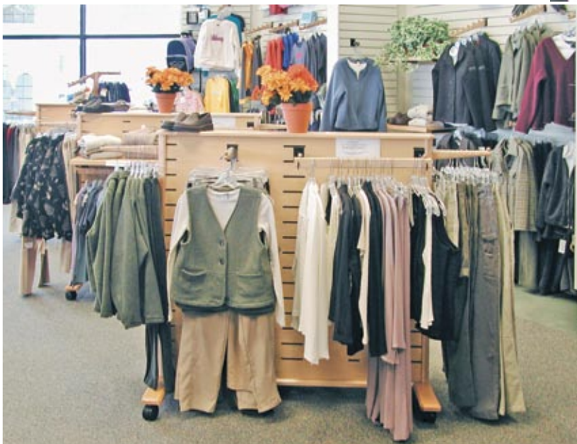
NEW-Wall Gondolas (pages 119-120).