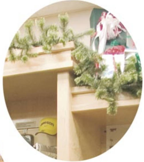
B. Clear Maple Upright Transition-right with Top Caps (no Headers).