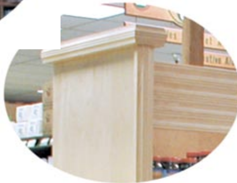
C. Clear Maple Left-end Upright with 2P1 Moulding and Panel Cap.