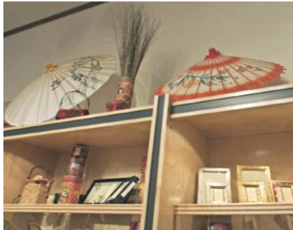
E. Clear Maple inside Upright and Headers with matching laminate detail.