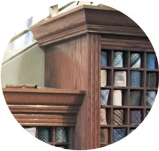
A. Stained Oak Upright Transition-left, Crown Moulding Top Cap and custom Tie Bin Insert.