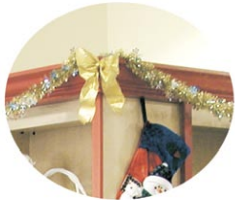
I. Maple Melamine right end Upright with Painted trim and Crown Moulding.