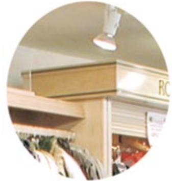
F. Clear Maple Transition-left Upright with Header and Top Cap with Stripe.