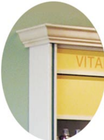
G. Maple Melamine right end Upright with painted trim and Crown Moulding.