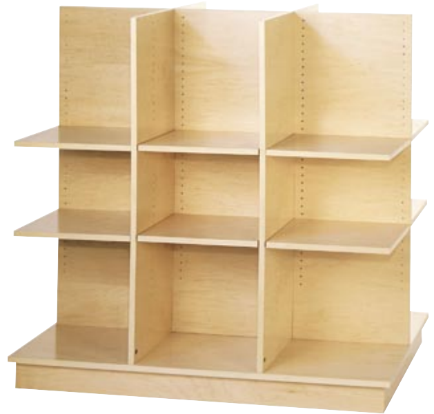
18-Bin Floor Unit