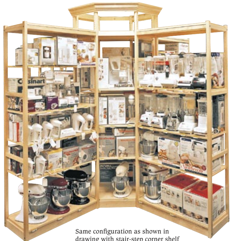
Same configuration as shown in drawing with stair-step corner shelf kits and site built Crown Moulding Cap. Lineal moulding for cap available by quotation.