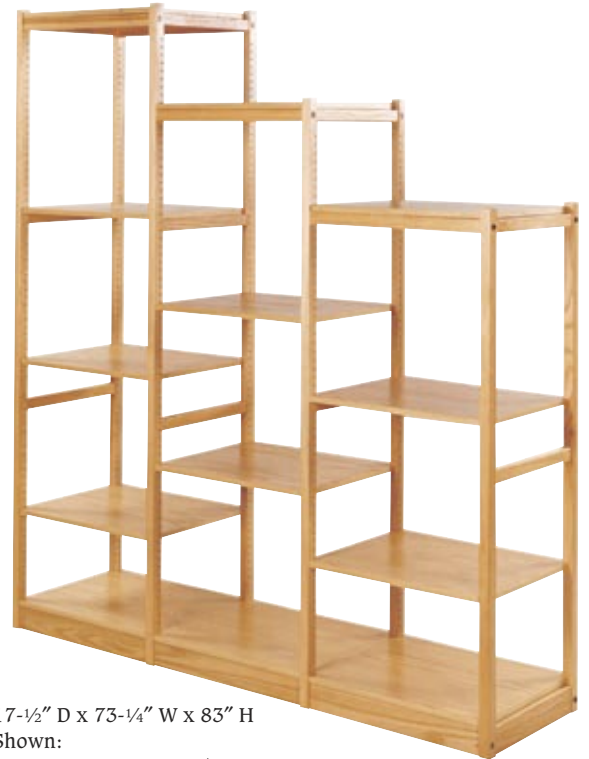
17-1/2" D x 73-1/4" W x 83" H Shown: S*Z-1724-837159-13 $1,160.00

Starter and Add-on Shelving units can be creatively configured and placed for maximum flexibility in merchandising. Single units or runs of starter and add-on units can be used against a wall, as partitions or as island displays.