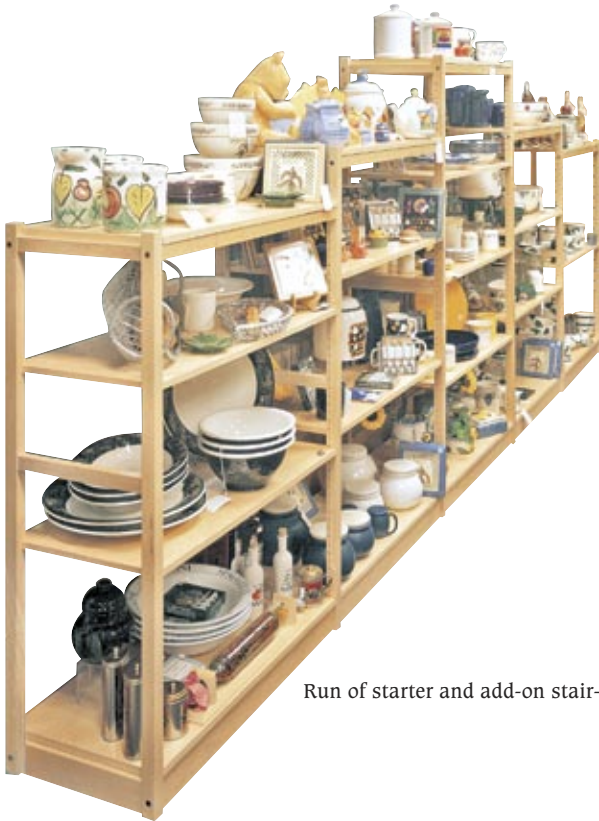
Run of starter and add-on stair-step shelving