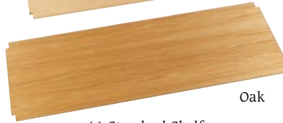
-11 Standard Shelf