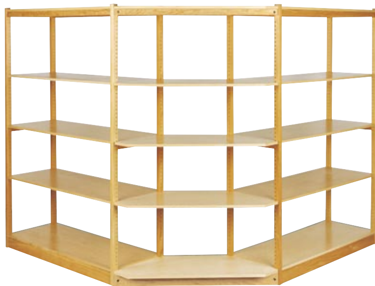
(2) Starter Units w/Corner Shelf Rail Kit & Corner Shelves