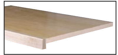
Shelf with 1-3/4" P0 Moulding Pattern - see page 19