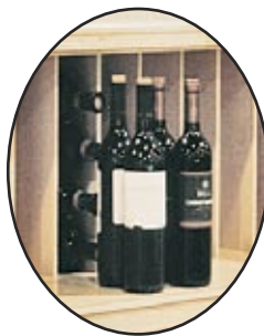
Detail of bottles