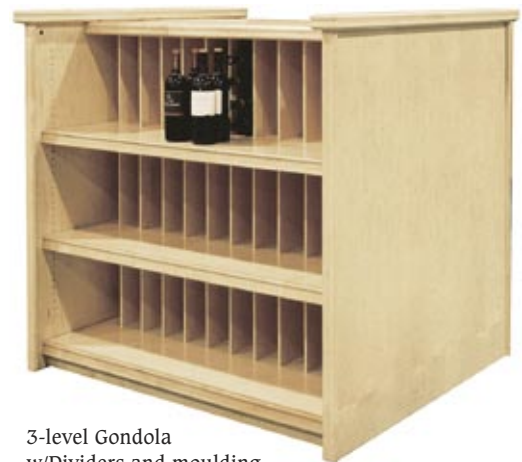
3-level Gondola w/Dividers and moulding