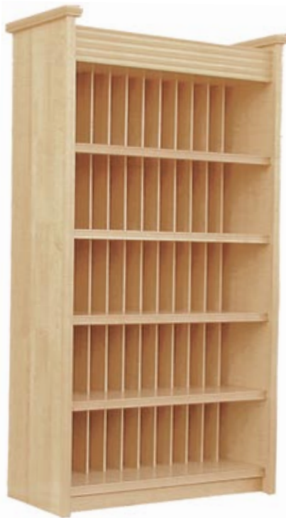
5-level Unit w/Dividers and Moulding

Wood-grained Melamine is priced with taped edges. Melamine with moulding by quotation.