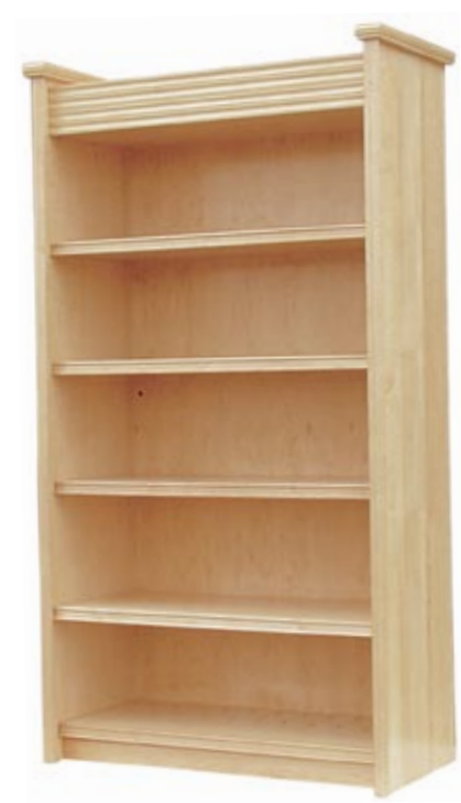
5-level Unit w/Shelves and Moulding