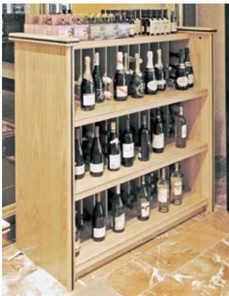
3-level Unit w/Dividers, moulding and accent stripe.

Units shown use Panel Caps. See page 175 for other Top Cap options.